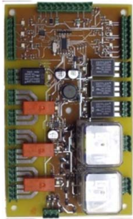
I/O Control Board